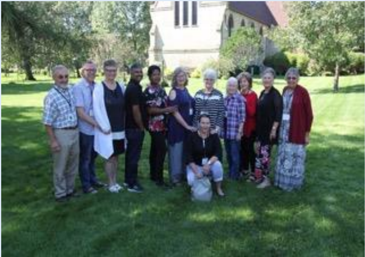
2019 ASK Gathering Canadian Attendees