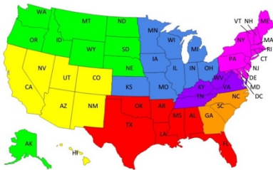
ASK.USA Zone Map

Last November our ASK USA Support Team met for a three day gathering to hear from the Lord about what might be on His heart for ASK USA. The Lord met with us in a profound way, guiding our discussion and melding us together as a team.